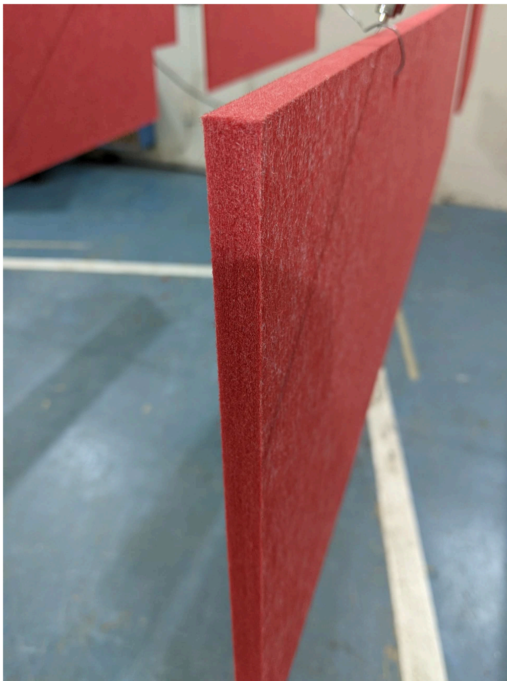
Figure 3 – Detail of specimen material